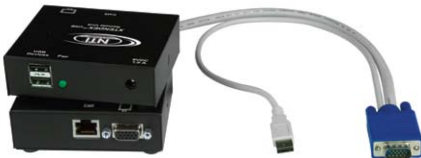
XTENDEX® ST-C5USBV-300 (Remote and Local Units)

Extend USB keyboard, USB mouse and VGA monitor up to 300 feet